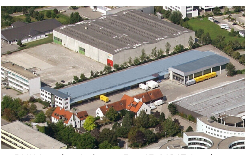
BMK Standort Steinerne Furt 63, 86167 Augsburg

The company BMK electronic services stayed at the industrial park "Deuterpark" until March 2022. Its new site "Steinerne Furt" is located at the commercial area Lechhausen Nord and the nearest residential building is 340 meters away. This site is also situated outside of conservation areas. BMK follows the robotics-producer Kuka and warehouse owners in renting the site and is surrounded by a flower shop and a garden center, a veterinarian practice and a pharmaceutical wholesales company. The industrial areas in the south and west are currently unused.